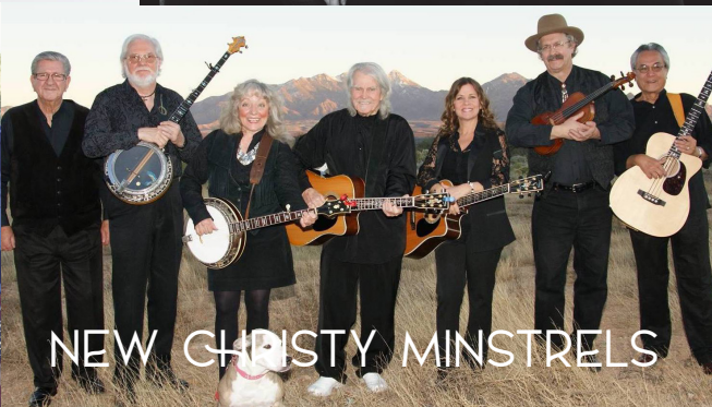
NEW CHRISTY MINSTRELS